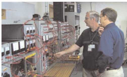
Power Generation and Synchronization

Solution: BPA purchased six of Lab-Volt's Electric Power Transmission Training Systems (Model 8055). The 8055 system allowed BPA to bring their power distribution system safely and effectively into the classroom. Technicians could now observe and analyze electrical phenomena that previously required advanced-level mathematics.