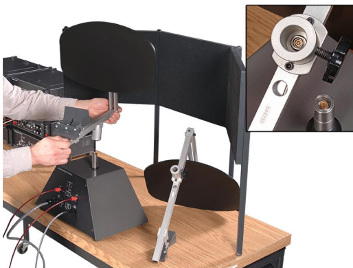
Figure 12. Antenna replacement is quick and easy thanks to miniature plug-in connectors in the antenna frame and antenna pedestal's shaft.

Range tracking is achieved by means of the split range-gate technique, whereas angle tracking is accomplished using lobe switching (sequential lobing). In addition to the fully automatic tracking mode, several useful ECCM features are available, such as a switchable lobing rate, a range tracking rate limiter in the range loop, manual control of either the range loop or the azimuth loop while the system is locked onto a target, and leading-edge range tracking. The computer-based interface of the tracking radar allows control of these functions and offers the same other possibilities as for the pulse radar system (visualization of the system's block diagrams, connection of virtual probes in the onscreen block diagrams, observation of signals on the built-in oscilloscope, fault insertion, etc.)